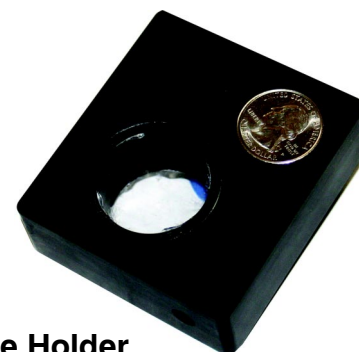
Small Quantity Sample Holder (Quarter Shown for Scale)