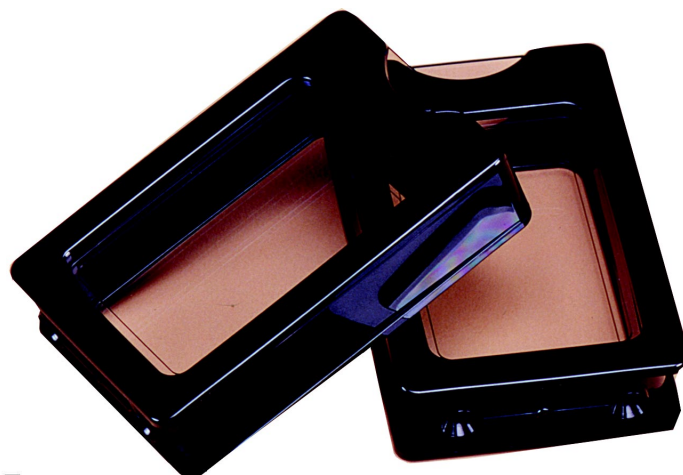
Standard Quantity Sample Holders

For Analysis ...Where you need it most ...When you need it most™